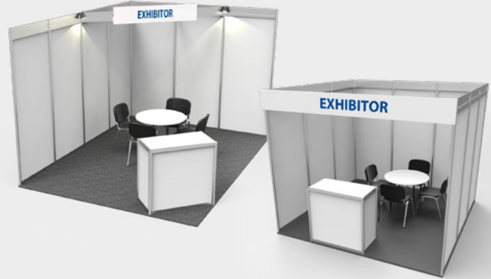
Exhibit space, shell scheme – white walls with aluminium frame, grey carpet, an information counter, a table with 4 chairs, spotlights, a trash can, name board, power supply up to 2kW, daily stand cleaning

CORNER PACKAGE 20 m 2 Discounted price: 5 800 EUR